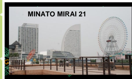
MINATO MIRAI 21