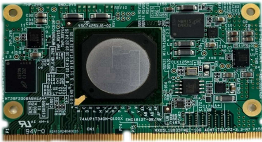
SMARC compliant Module Size : 82mm(W) x 50mm(D) x 15mm(H)

Switch Device : Microchip VSC7425 18 Port Managed L2 Switch with 12 Cu PHYs