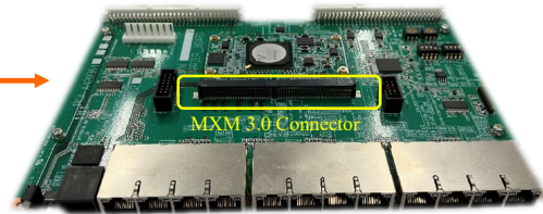
Carrier board example, we can provide custom board design